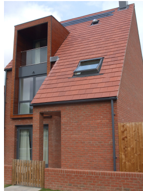
Pilot House – Temple Avenue