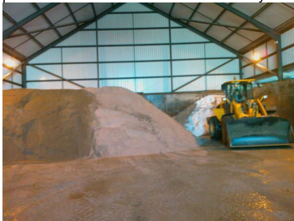
Salt Barn at Eco Depot – there is more salt in it now !

Contact with the Council last winter was difficult at weekends and evenings and although by the end of the severe weather this had improved, a major part of this review investigated ways to ensure that there were systems in place that could be activated quickly. YCC are looking at ways of utilising home working, the Warden Call service and the Police control room to make this happen and the technology is in place to allow calls to be diverted directly to the highways section at the Ecodepot.