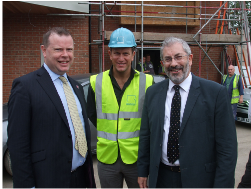
St Ann's Court building site for the supported living centre (Sir Bob Kerslake on right)